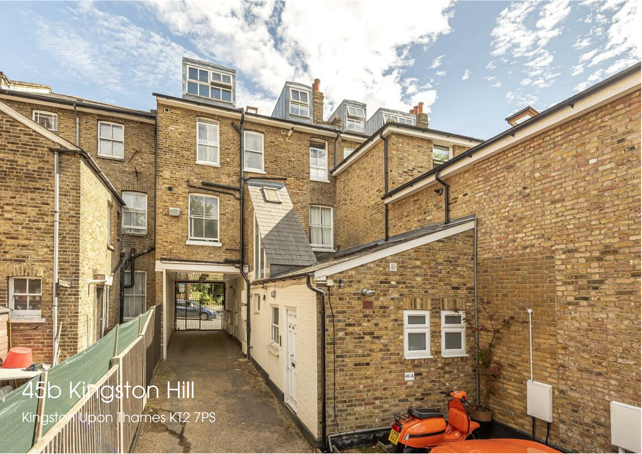
45b Kingston Hill Kingston Upon Thames KT2 7PS